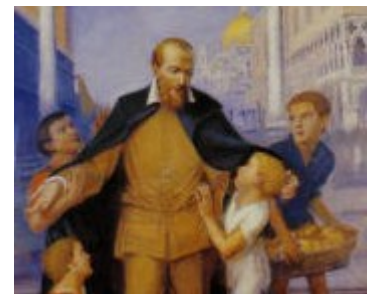
St. Jerome Emillani

St. Jerome Emiliani is not very well known. All the same, the Church has given him a special title: "Universal Patron Saint of Orphans and Abandoned Youth." He was a nobleman in Venice at a time when his native city and the whole of Europe were devastated by famine and the plague. Rather than seek refuge behind his nobility and comfortable social status, Jerome instead listened to "the infinite lament of the poor". By day, he spent the money he earned by selling his possessions to assist as many poor people as possible, while at night he went through the city gathering up the sick and burying the corpses he found abandoned in the Venetian alleyways. Eventually, he gathered around him several hundred homeless children, creating a type of extended family for them. He provide the youngsters with vocation teachers in addition to the means and classrooms to educate them. In this, he introduced them to a dignified life of work. The pillars of the school were prayer, charity, and work.